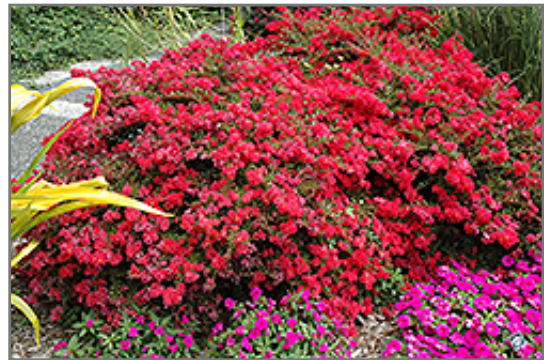
Cherry Dazzle Crapemyrtle in bloom