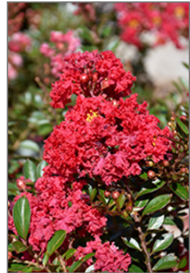
Cherry Dazzle Crapemyrtle flowers

Cherry Dazzle Crapemyrtle is recommended for the following landscape applications;