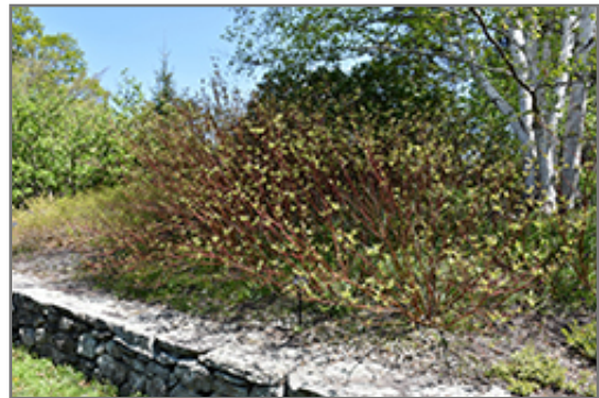
Bailey's Red Twig Dogwood in spring