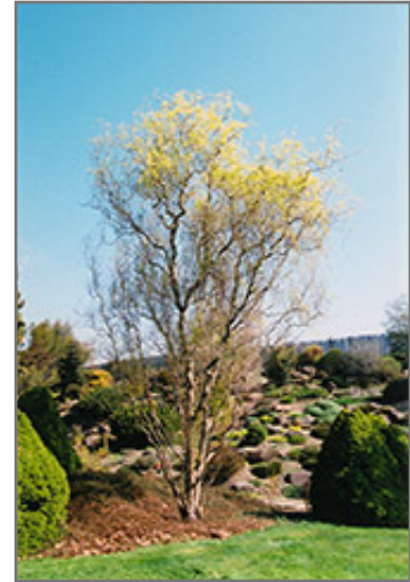
Dragon's Claw Willow in winter