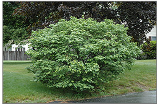
Compact Winged Burning Bush

Compact Winged Burning Bush will grow to be about 7 feet tall at maturity, with a spread of 7 feet. It tends to fill out right to the ground and therefore doesn't necessarily require facer plants in front, and is suitable for planting under power lines. It grows at a slow rate, and under ideal conditions can be expected to live for 50 years or more.