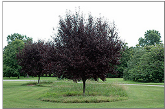
Krauter Vesuvius Plum

This tree should only be grown in full sunlight. It does best in average to evenly moist conditions, but will not tolerate standing water. It is not particular as to soil type or pH. It is highly tolerant of urban pollution and will even thrive in inner city environments. This is a selected variety of a species not originally from North America.