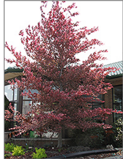
Tricolor Beech