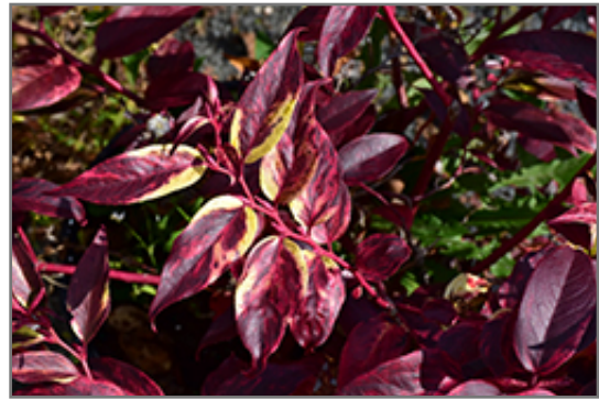
Rainbow Fetterbush in fall

Rainbow Fetterbush makes a fine choice for the outdoor landscape, but it is also well-suited for use in outdoor pots and containers. Because of its height, it is often used as a 'thriller' in the 'spiller-thriller-filler' container combination; plant it near the center of the pot, surrounded by smaller plants and those that spill over the edges. It is even sizeable enough that it can be grown alone in a suitable container. Note that when grown in a container, it may not perform exactly as indicated on the tag - this is to be expected. Also note that when growing plants in outdoor containers and baskets, they may require more frequent waterings than they would in the yard or garden.