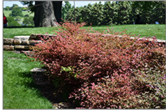
Flirt Nandina

Flirt Nandina is recommended for the following landscape applications;