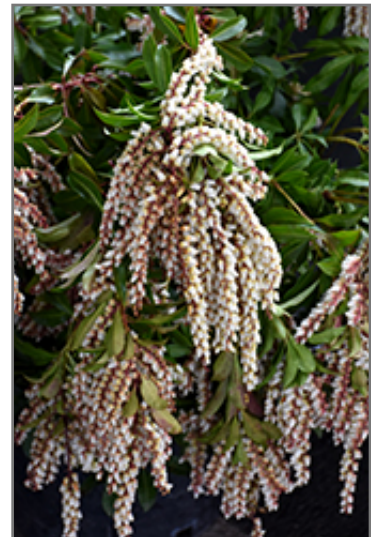
Mountain Fire Japanese Pieris flowers