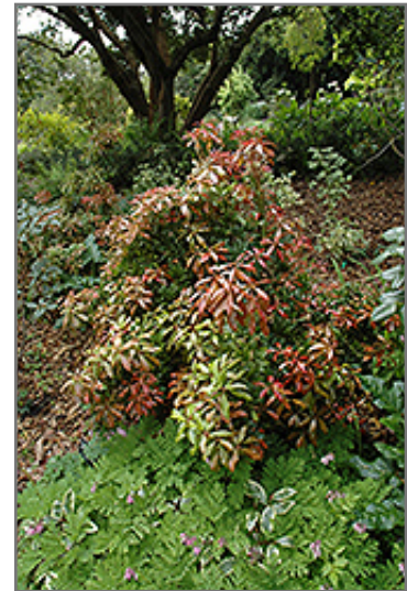
Mountain Fire Japanese Pieris

This shrub does best in full sun to partial shade. It requires an evenly moist well-drained soil for optimal growth, but will die in standing water. It is very fussy about its soil conditions and must have rich, acidic soils to ensure success, and is subject to chlorosis (yellowing) of the foliage in alkaline soils. It is somewhat tolerant of urban pollution, and will benefit from being planted in a relatively sheltered location. Consider applying a thick mulch around the root zone in winter to protect it in exposed locations or colder microclimates. This is a selected variety of a species not originally from North America, and parts of it are known to be toxic to humans and animals, so care should be exercised in planting it around children and pets.