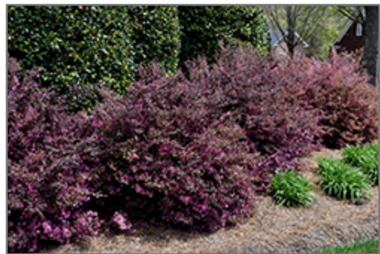
Purple Diamond Fringeflower in bloom