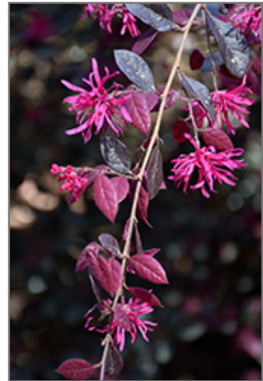
Purple Diamond Fringeflower flowers

Purple Diamond Fringeflower is recommended for the following landscape applications;