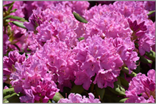
Roseum Elegans Rhododendron flowers