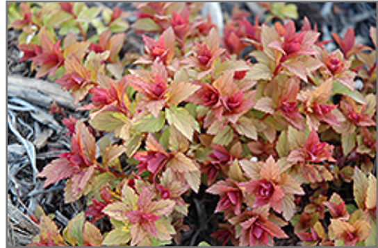
Magic Carpet Spirea foliage

Magic Carpet Spirea will grow to be about 24 inches tall at maturity, with a spread of 3 feet. It tends to fill out right to the ground and therefore doesn't necessarily require facer plants in front. It grows at a fast rate, and under ideal conditions can be expected to live for approximately 20 years.