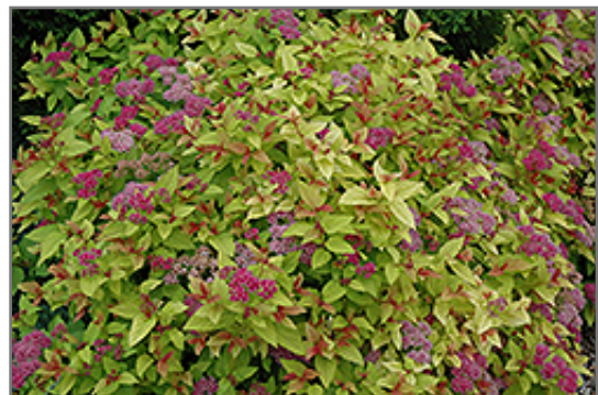
Magic Carpet Spirea flowers