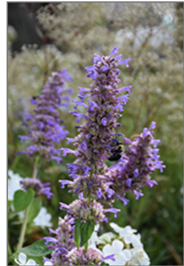
Blue Boa Hyssop flowers