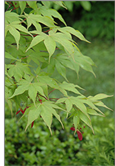
Osakazuki Japanese Maple foliage

This tree does best in full sun to partial shade. You may want to keep it away from hot, dry locations that receive direct afternoon sun or which get reflected sunlight, such as against the south side of a white wall. It prefers to grow in average to moist conditions, and shouldn't be allowed to dry out. It is not particular as to soil pH, but grows best in rich soils. It is somewhat tolerant of urban pollution, and will benefit from being planted in a relatively sheltered location. Consider applying a thick mulch around the root zone in winter to protect it in exposed locations or colder microclimates. This is a selected variety of a species not originally from North America.