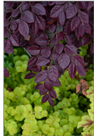
Crimson Fire Chinese Fringeflower foliage

This shrub does best in full sun to partial shade. It prefers to grow in average to moist conditions, and shouldn't be allowed to dry out. It is particular about its soil conditions, with a strong preference for rich, acidic soils. It is somewhat tolerant of urban pollution. Consider applying a thick mulch around the root zone in winter to protect it in exposed locations or colder microclimates. This is a selected variety of a species not originally from North America.