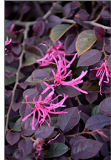
Crimson Fire Chinese Fringeflower flowers

Crimson Fire Chinese Fringeflower is recommended for the following landscape applications;