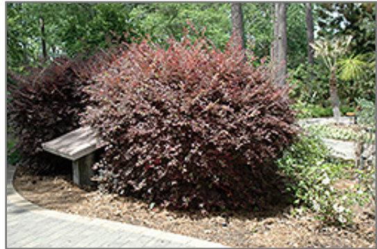
Daruma Chinese Fringeflower