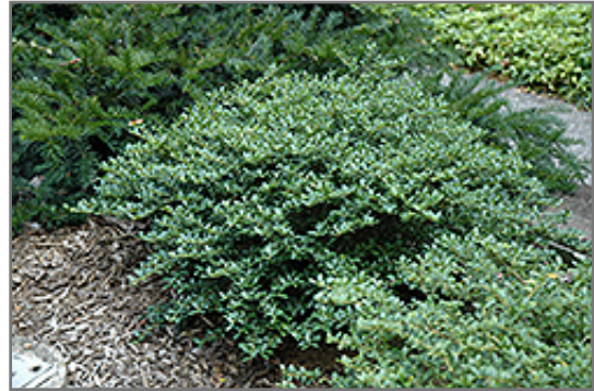
Helleri Japanese Holly