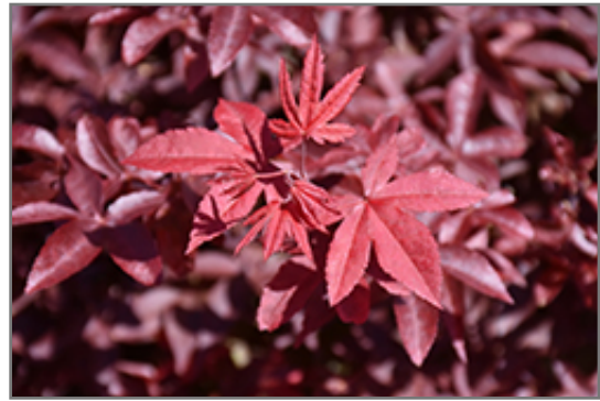
Rhode Island Red Japanese Maple foliage

Rhode Island Red Japanese Maple will grow to be about 12 feet tall at maturity, with a spread of 12 feet. It has a low canopy with a typical clearance of 3 feet from the ground, and is suitable for planting under power lines. It grows at a slow rate, and under ideal conditions can be expected to live for 80 years or more.