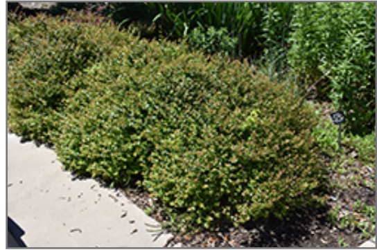
Rose Creek Abelia

Rose Creek Abelia makes a fine choice for the outdoor landscape, but it is also well-suited for use in outdoor pots and containers. Because of its height, it is often used as a 'thriller' in the 'spiller-thriller-filler' container combination; plant it near the center of the pot, surrounded by smaller plants and those that spill over the edges. It is even sizeable enough that it can be grown alone in a suitable container. Note that when grown in a container, it may not perform exactly as indicated on the tag - this is to be expected. Also note that when growing plants in outdoor containers and baskets, they may require more frequent waterings than they would in the yard or garden.