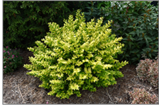
Golden Ticket Privet