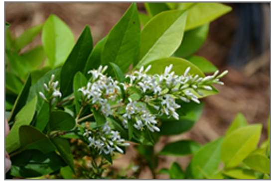
Golden Ticket Privet flowers

This shrub should only be grown in full sunlight. It is very adaptable to both dry and moist locations, and should do just fine under average home landscape conditions. It is not particular as to soil type or pH, and is able to handle environmental salt. It is highly tolerant of urban pollution and will even thrive in inner city environments. This particular variety is an interspecific hybrid.