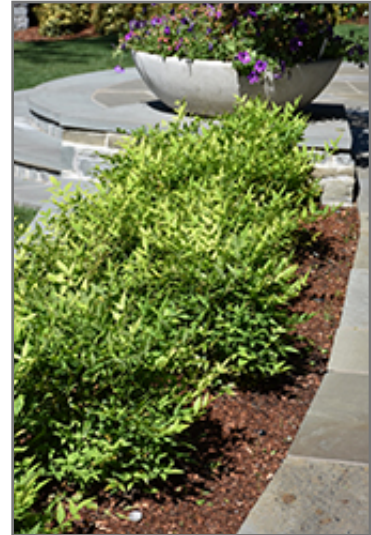
Lemon Lime Nandina