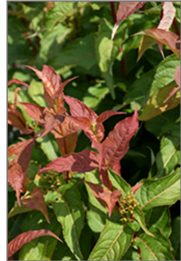
Kodiak Orange Diervilla foliage

Kodiak Orange Diervilla is recommended for the following landscape applications;