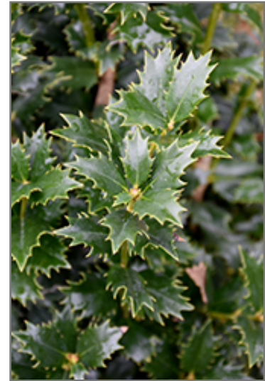
Acadiana Holly foliage