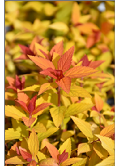
Double Play Candy Corn Spirea foliage

Double Play Candy Corn Spirea is recommended for the following landscape applications;