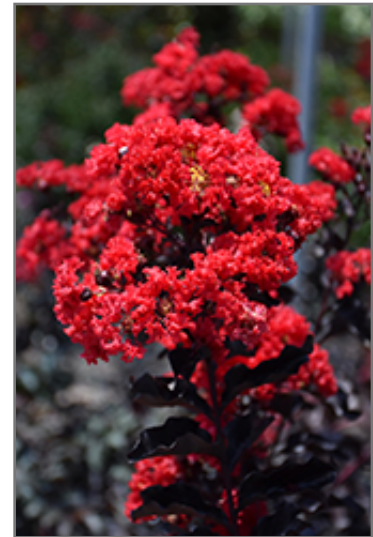
Black Diamond Best Red Crapemyrtle flowers

Black Diamond Best Red Crapemyrtle is recommended for the following landscape applications;