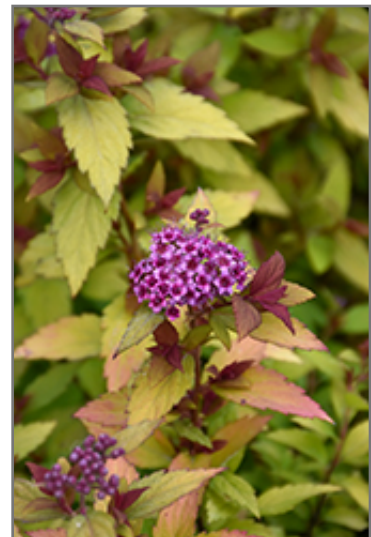
Poprocks Rainbow Fizz Spirea flowers