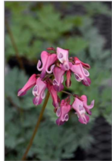
Pink Diamonds Fern-leaved Bleeding Heart flowers

Pink Diamonds Fern-leaved Bleeding Heart is a fine choice for the garden, but it is also a good selection for planting in outdoor pots and containers. It is often used as a 'filler' in the 'spiller-thriller-filler' container combination, providing a mass of flowers and foliage against which the thriller plants stand out. Note that when growing plants in outdoor containers and baskets, they may require more frequent waterings than they would in the yard or garden.