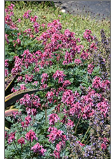
Pink Diamonds Fern-leaved Bleeding Heart flowers

Pink Diamonds Fern-leaved Bleeding Heart is an herbaceous perennial with a mounded form. It brings an extremely fine and delicate texture to the garden composition and should be used to full effect.