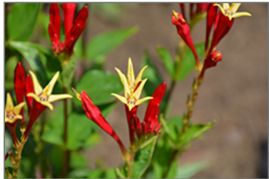
Little Redhead Indian Pink flowers