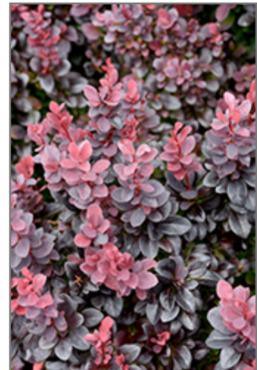
Concorde Japanese Barberry foliage