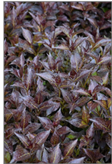
Midnight Wine Shine Weigela foliage