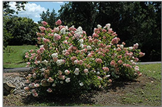
Vanilla Strawberry Hydrangea in bloom