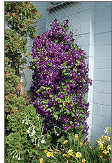
Jackmanii Superba Clematis in bloom