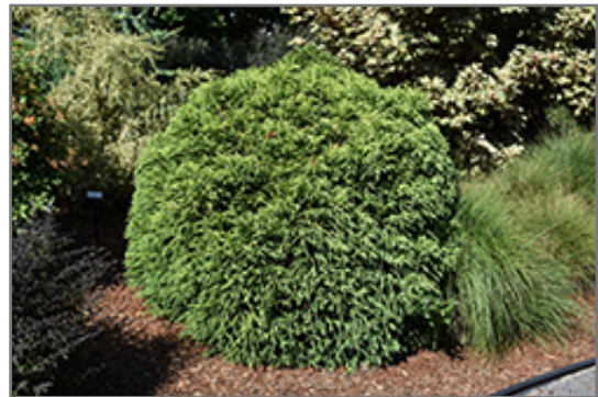
Dwarf Globe Japanese Cedar