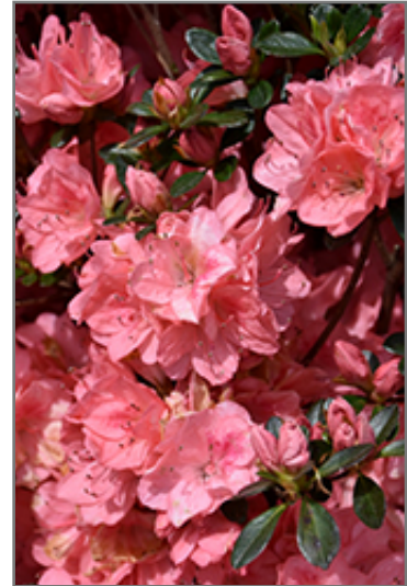
Blaauw's Pink Azalea flowers

This shrub does best in full sun to partial shade. You may want to keep it away from hot, dry locations that receive direct afternoon sun or which get reflected sunlight, such as against the south side of a white wall. It requires an evenly moist well-drained soil for optimal growth, but will die in standing water. It is very fussy about its soil conditions and must have rich, acidic soils to ensure success, and is subject to chlorosis (yellowing) of the foliage in alkaline soils. It is somewhat tolerant of urban pollution, and will benefit from being planted in a relatively sheltered location. Consider applying a thick mulch around the root zone in winter to protect it in exposed locations or colder microclimates. This particular variety is an interspecific hybrid.