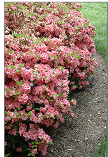
Blaauw's Pink Azalea in bloom