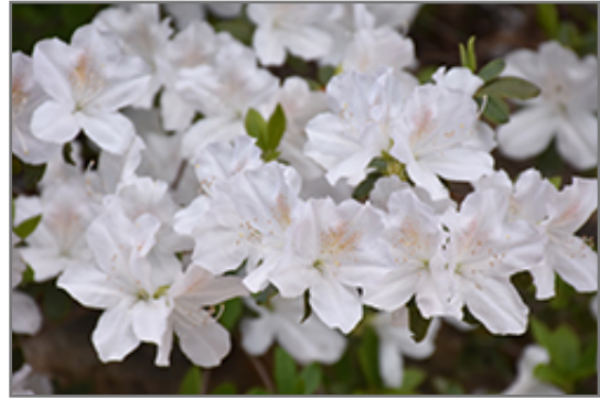
Delaware Valley White Azalea flowers