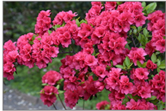
Hershey's Red Azalea flowers

Hershey's Red Azalea makes a fine choice for the outdoor landscape, but it is also well-suited for use in outdoor pots and containers. With its upright habit of growth, it is best suited for use as a 'thriller' in the 'spiller-thriller-filler' container combination; plant it near the center of the pot, surrounded by smaller plants and those that spill over the edges. It is even sizeable enough that it can be grown alone in a suitable container. Note that when grown in a container, it may not perform exactly as indicated on the tag - this is to be expected. Also note that when growing plants in outdoor containers and baskets, they may require more frequent waterings than they would in the yard or garden.