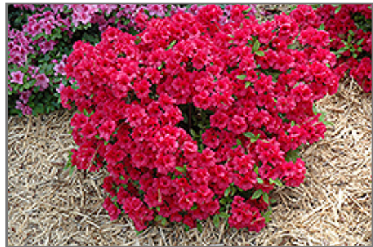
Hershey's Red Azalea flowers