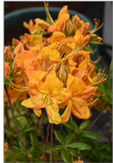
Klondyke Azalea flowers