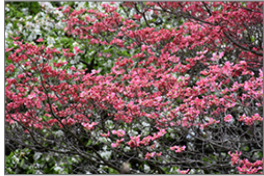
Cherokee Chief Flowering Dogwood flowers

Cherokee Chief Flowering Dogwood will grow to be about 30 feet tall at maturity, with a spread of 35 feet. It has a low canopy with a typical clearance of 4 feet from the ground, and should not be planted underneath power lines. It grows at a slow rate, and under ideal conditions can be expected to live for approximately 30 years.