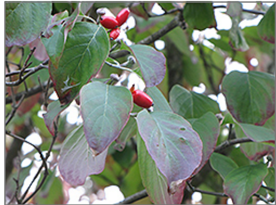
Cherokee Chief Flowering Dogwood fruit

This tree does best in full sun to partial shade. You may want to keep it away from hot, dry locations that receive direct afternoon sun or which get reflected sunlight, such as against the south side of a white wall. It requires an evenly moist well-drained soil for optimal growth, but will die in standing water. It is very fussy about its soil conditions and must have rich, acidic soils to ensure success, and is subject to chlorosis (yellowing) of the foliage in alkaline soils. It is quite intolerant of urban pollution, therefore inner city or urban streetside plantings are best avoided, and will benefit from being planted in a relatively sheltered location. Consider applying a thick mulch around the root zone in winter to protect it in exposed locations or colder microclimates. This is a selection of a native North American species.